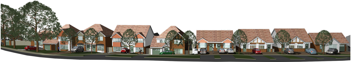
Back Lane : Street Elevation