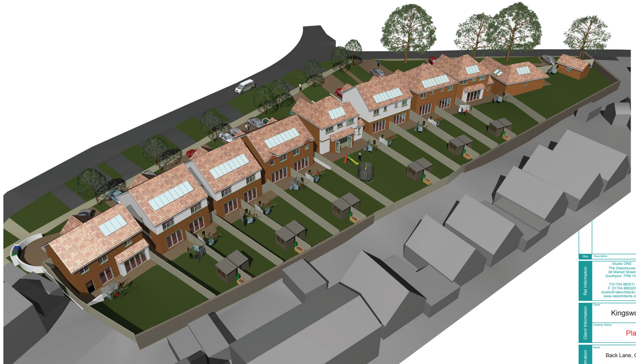
Aerial View : Rear